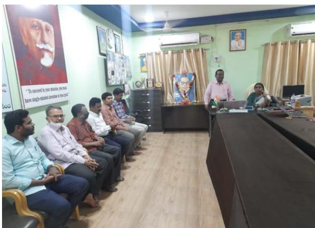
In the College