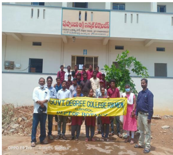
Industrial visit by Dept of botany ,and Biotechnology to Pushpanjali Agribiotech technologies Kallur.on 30.4.2022