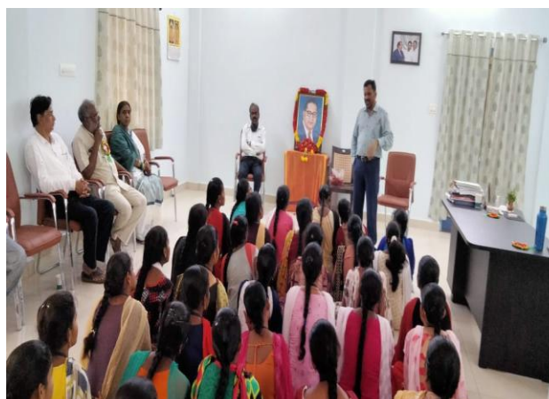
.In Cluster University, Kurnool